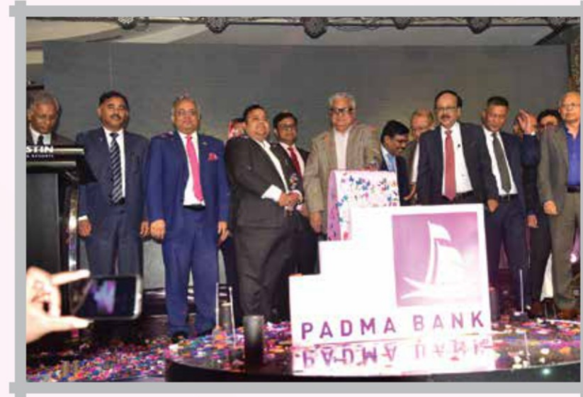
Grand Logo Unveiling Ceremony