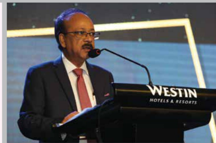
MD & CEO of Padma Bank delivering his speech at Logo Unveiling Ceremony of Padma Bank