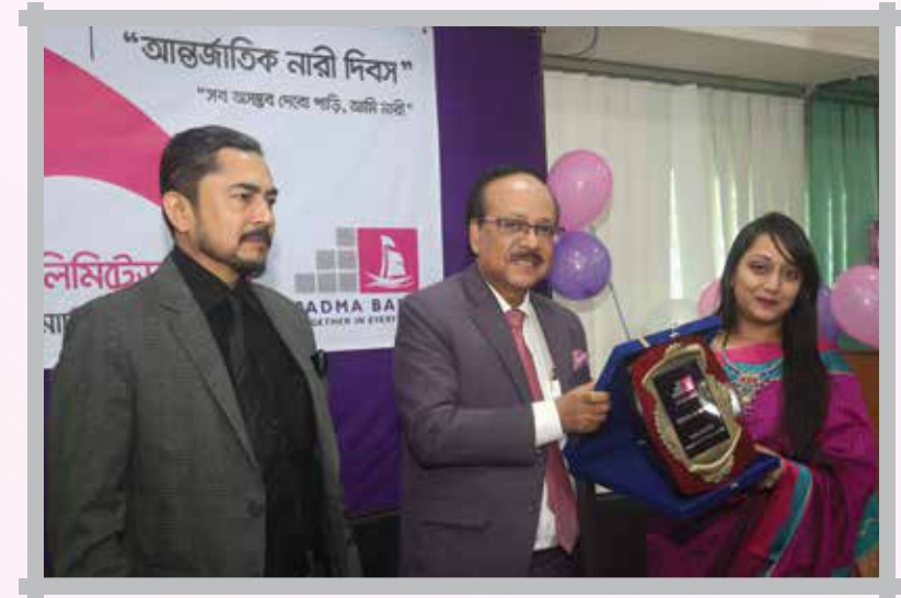
Padma Bank observed International Women's Day