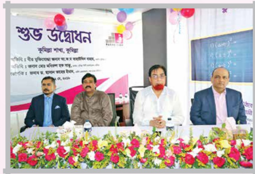
Inaugural Ceremony of Cumilla Branch in its new location