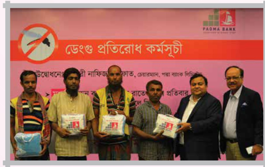
CSR Activities: Distribution of mosquito nets as a part of Dengue Prevention Program