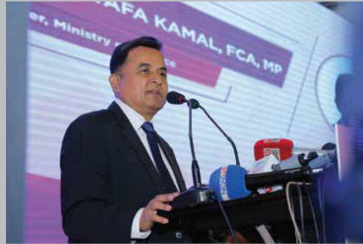
Honorable Finance Minister delivering his valuable speech at Annual Business Conference