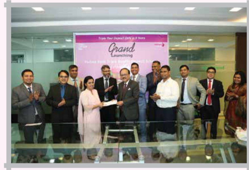
Launching Ceremony of New Deposit Product and handover of instrument by MD & CEO