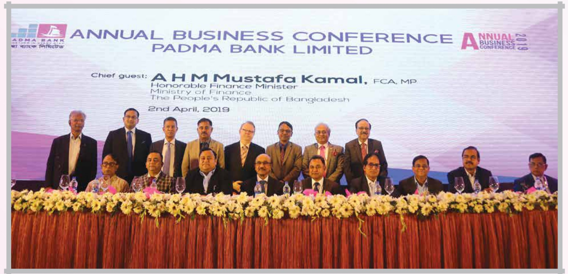
Honorable guests of Annual Business Conference 2019