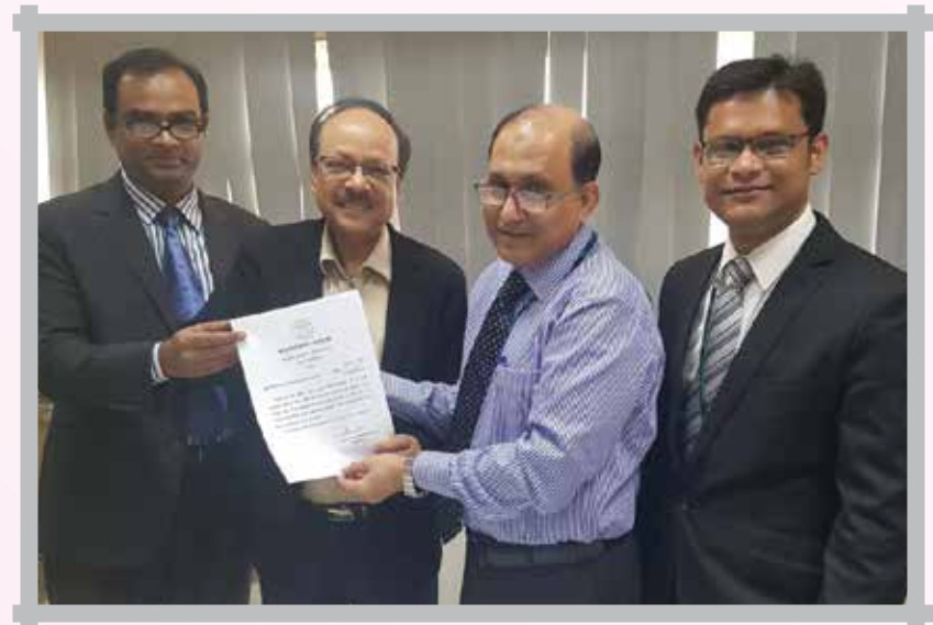
Handover session of Banking License