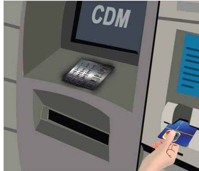
CASH DEPOSIT MACHINE