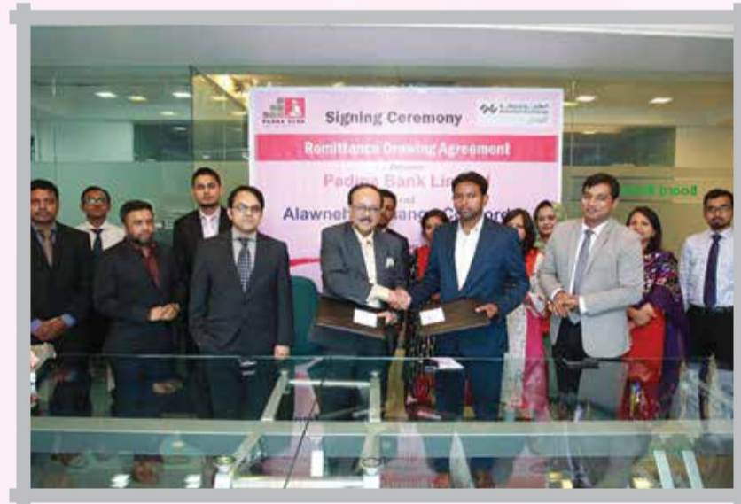
Remittance Drawing Agreement Ceremony