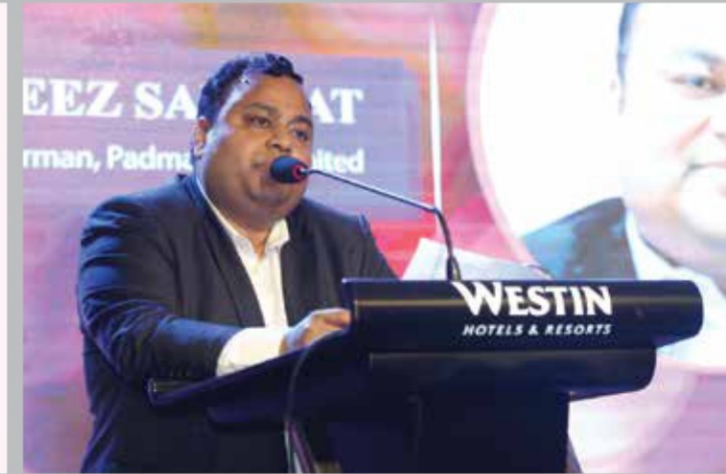
Honorable Chairman of Padma Bank delivering speech at Logo Unveiling Ceremony of Padma Bank