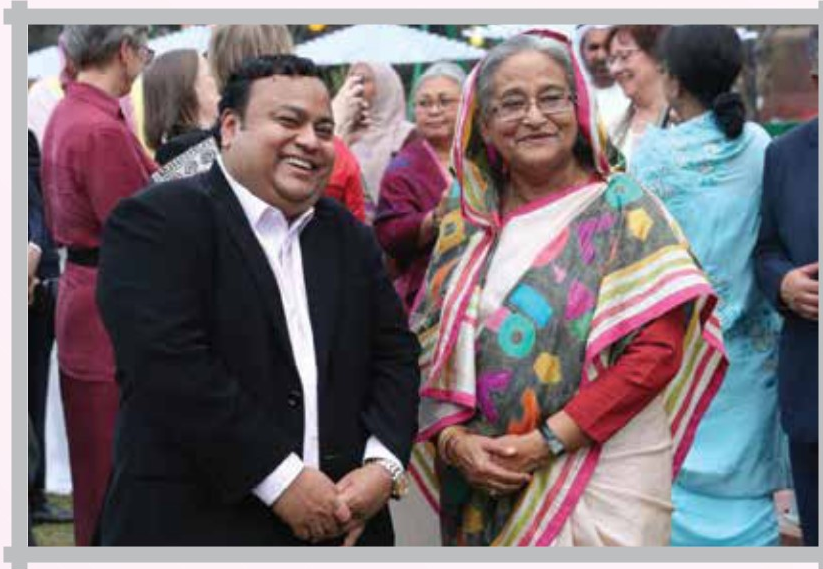
Honorable Prime Minister greeted by Chairman of Padma Bank