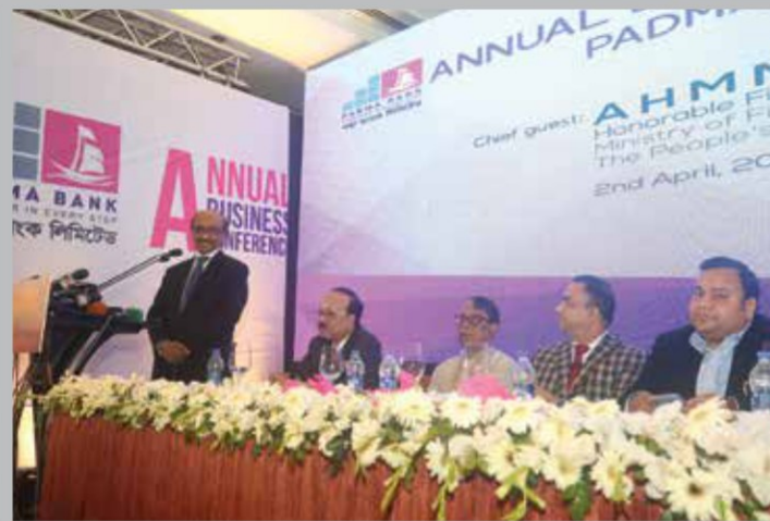
Honorable Governor of Central Bank delivering his valuable speech at Annual Business Conference